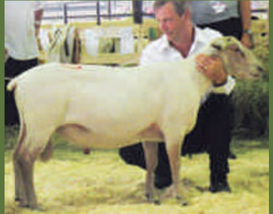
FCS 28T A son of FCS 28P at the CSBA Sheep Classic 2008