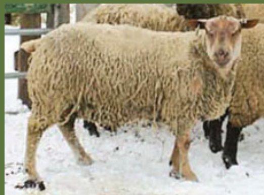
FSC 38P 2007 Progeny

DG 5137 FOULRICE EXPLORER DG DG 4083 D: FIELD STONE 8L FIELD STONE 3F FIELD STONE 15H FIELD STONE 5F