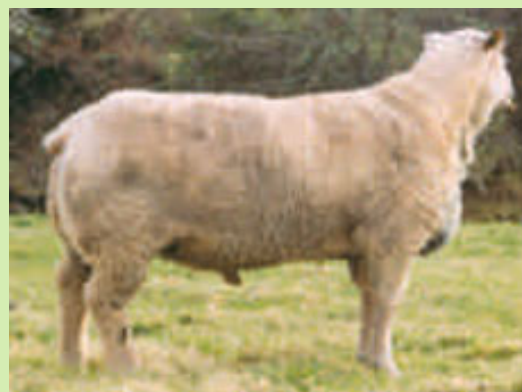
CASTELLAU ULTRA TZ 8100 SIRE OF HALF DIAMOND 209P Photos taken 08/02 After his season's work!